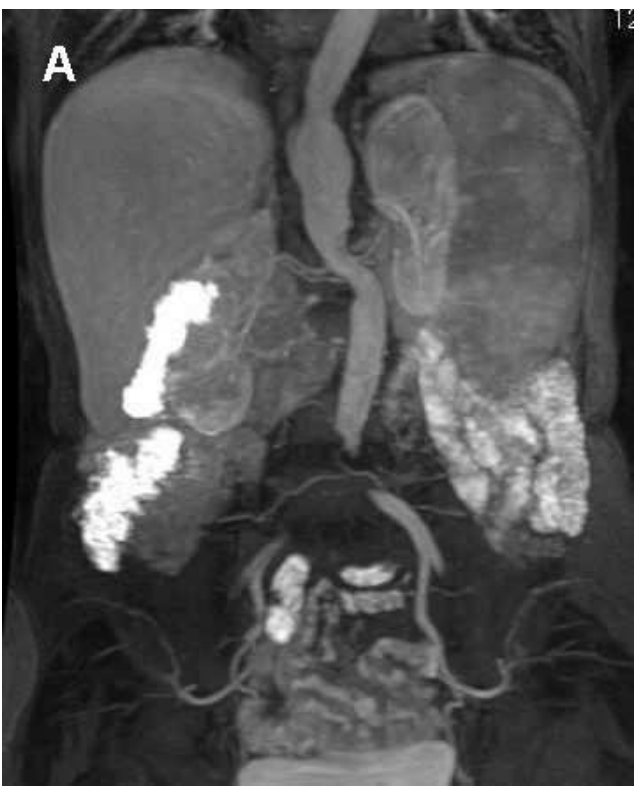
Fig A: Magnetic Resonance Angiography showing abdominal aortic Aneurysm of 3.5cms width and 6cms long is extending up to origin of renal Arteries and characteristic finding of string of beads appearance in distal renal arteries suggestive of fibro muscular dysplasia.