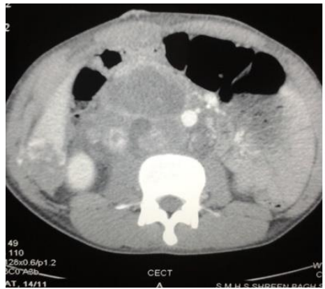
Fig 1: CECT Abdomen showing Retroperitoneal Lymph node mass with areas of necrosis and Metastatic deposit in segment-6 of liver

cavity, a retroperitoneal lymph node mass and a hypodense lesion, suggestive of metastatic deposit, in right lobe of liver. Abdominocentesis revealed blood in peritoneal cavity. CECT of the abdomen showed a large retroperitoneal lymph node mass with focal areas of necrosis and a metastatic deposit in segment 6 of liver as shown in figure 1.