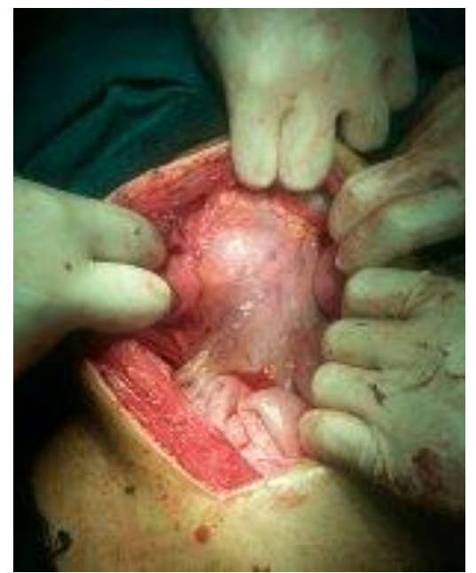
Fig. 2: Retroperitoneal lymph node mass

Following a thorough peritoneal lavage, biopsies were taken from both bleeding liver lesion as well as retroperitoneal lymph node mass. Hemostasis was achieved by suturing the raw areas with catgut over gel foam. Abdominal drain was placed and wound closed back. Postoperative tumor marker level was \beta -HCG- 7700mlU/ml (normal value<5mlU/ml), \alpha -Feto protein - 942.1ng/ml (normal value 0-10ng/m), LDH-1190U/L (normal value 230-460U/L). Histopathology of both the liver lesion and retroperitoneal lymph node showed metastatic deposits of mixed germ cell tumor as shown in figure -3.