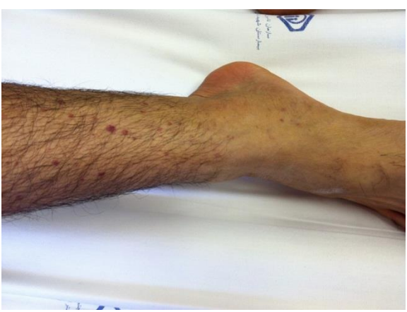
Fig 3: Purpura and petechiae on patient's leg

The patient had complaint of abdominal pain during treatment, but abdomino-pelvic CT scan was normal ( Figure 4 ).