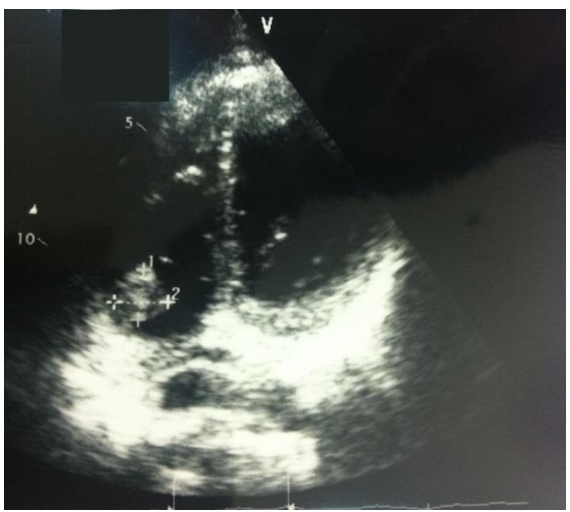
Fig 2: Trans esophageal echocardiography