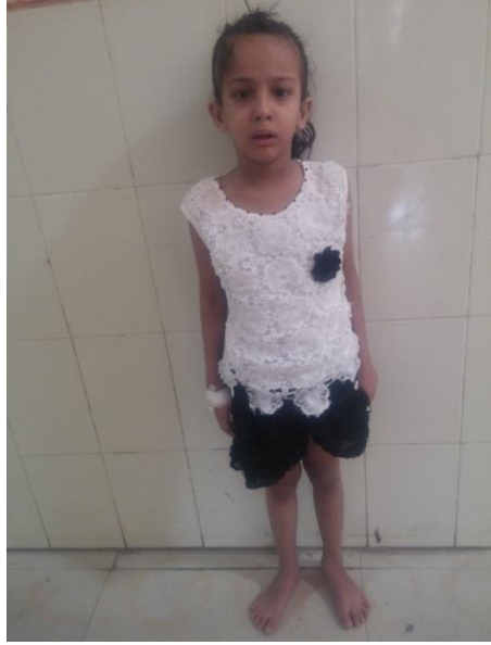
Fig-1: Physical appearance of the patient

Based on the history and physical findings a diagnosis of Kartagener syndrome was made. Chest physiotherapy and appropriate antimicrobial therapy was advised, child is on follow-up.