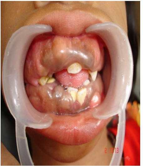
Fig-1: hypertrophied gingiva

The extra oral examination did not reveal any abnormality except the incompetent lips. The intraoral examination revealed generalized, severe gingival hyperplasia involving both buccal and lingual in the maxillary and mandibular arches. The enlarged gingival tissues covered two-thirds or more of the clinical crowns of almost all teeth. The gingiva was pink and firm but the patient's oral hygiene was very poor [Figure 1].