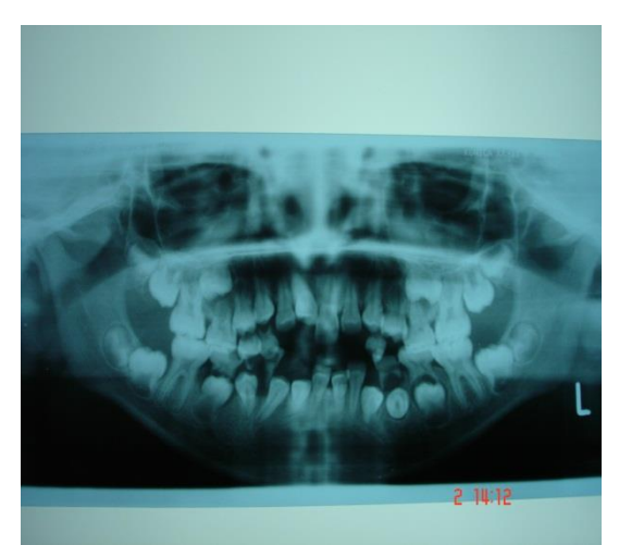
Fig-2: X-ray showing teeth

Panoramic radiographic examination revealed multiple retained primary teeth and all permanent teeth which are nearing the completion of root formation and erupted through alveolar process but hidden under hyperplastic gingiva (Figure 2).