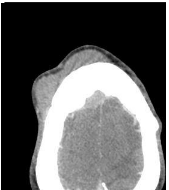
Fig-1: CT brain - Diffuse hyperostosis of the right parietal bone with enhancing soft tissue component involving the scalp

stage 1AE. She was started on combination chemotherapy with Rituximab, cyclophosphamide, doxorubicin, vincristine and prednisolone (R-CHOP regimen).There was complete resolution of the tumor clinically after 2 cycles of chemotherapy. Radiological remission was documented after 6 cycles of chemotherapy. She was then consolidated with radiation.