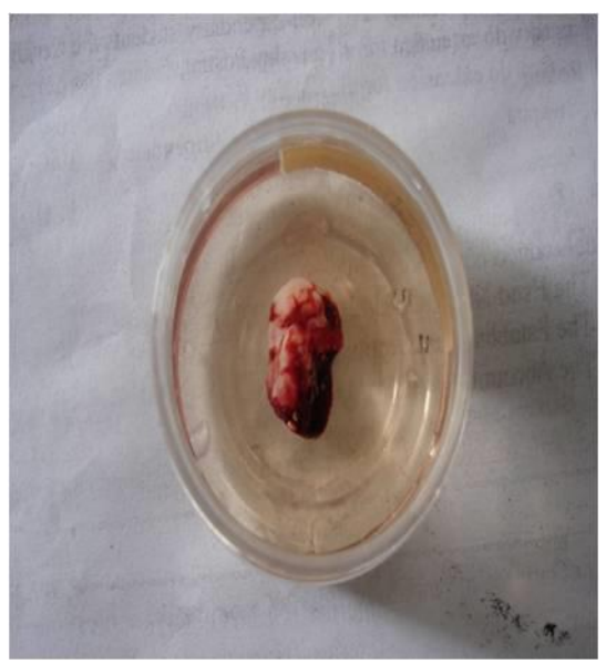
Fig-2: Gross image