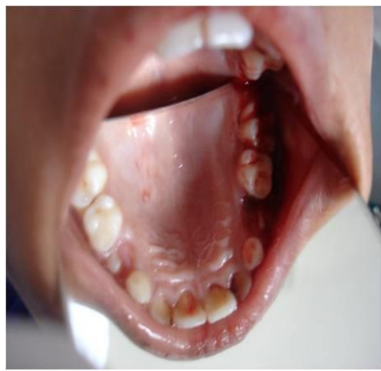
Fig-3: Post-operative image