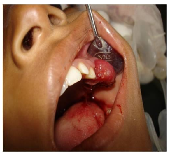
Fig-1: Lobulated growth (pre-surgical)