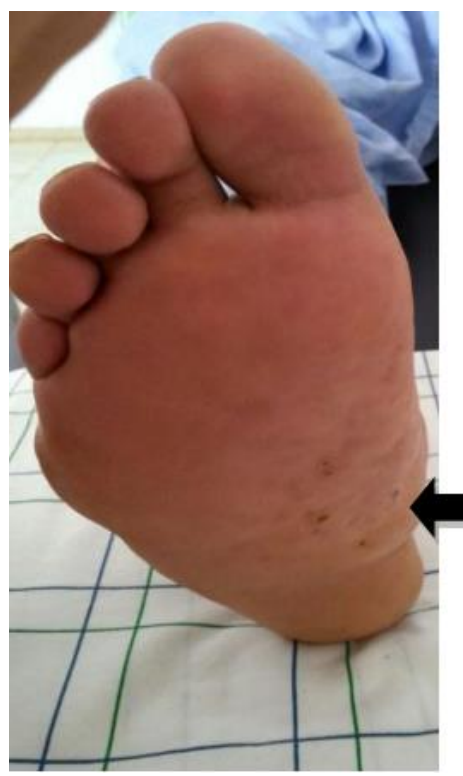
Fig 2: Fistula scars plantar level (Arrow)