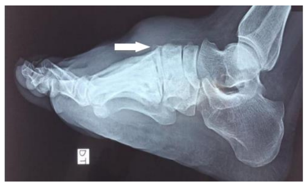
Fig 3: Profile radiograph of the right foot showing soft tissue swelling and periosteal reaction.