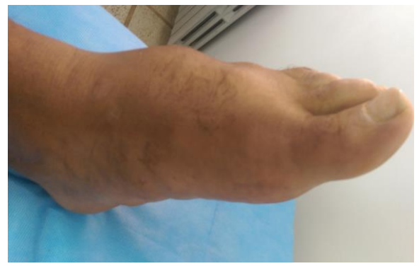
Fig 5: Right foot after 6 months of evolution; there is a regression of the swelling of the midfoot.