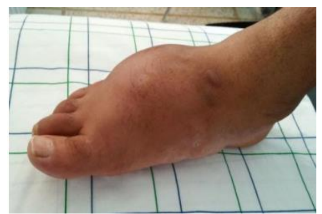
Fig 1: Swelling of the Midfoot