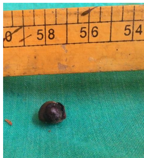
Fig-1: Showing gross appearance of the tumor

On gross examination, a brownish mass measuring 1.5 X 1.5 X 1.5cms was seen which was greyish white on cut section. H &E stained sections from the mass showed papillary and complex glandular structures. Papillary structures had fibrovascular core and were lined by columnar cells with eosinophilic cytoplasm. A diagnosis of papillary hidradenoma was made based on these histopathologic findings.