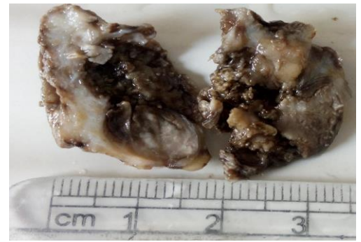
Fig-3: Gross appearance of the resected specimen

Figure 1 shows CT scan of brain revealing focal osteolytic lesion in the left occipital region along with focal bulge of the overlying scalp and figure 2 shows MRI brain revealing mildly enhancing space occupying lesion at left occipital bony calvarium eroding its inner and outer tables and abutting meninges