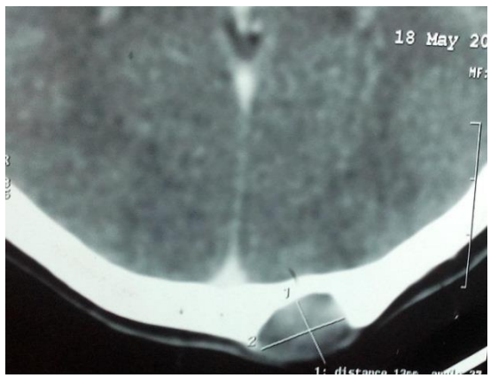
Fig-1: CT scan of brain

greyish white cystic mass measuring 30mm x 15mm (Figure 3) and containing greyish white oily material on cut section. Microscopic examination of the tissue showed the presence of lamellated keratin material in a cystic cavity lined by keratizing squamous epithelium. No dermal appendage was present in the wall of the cyst (Figure 4 and 5). So the diagnosis of intracranial epidermal cyst was given and further treatment was given. On her first follow up visit at one month, neurological status of the patient was evaluated and no abnormality was detected.