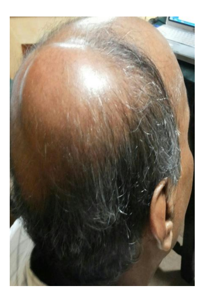
Fig 1: Clinical photograph of the patient showing the scalp tumour

for follow up. On examination, there was a smooth, non-tender, variegated swelling of 10cm x 8cm at the right parieto-occipital region of scalp (Fig.1). It was fixed to the underlying bone but free from overlying skin.