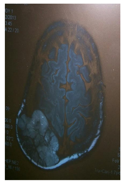
Fig 3: MRI showing well circumscribed tumour without any brain involvement.

Chest x-ray was normal. Abdominal CT scan showed no local or regional recurrence. Fine needle aspiration cytology from the scalp swelling showed papillary cluster of cells having moderate amount of granular eosinophilic vacuolated cytoplasm and eccentrically placed round to oval nuclei having irregular nuclear membrane, and prominent macro nucleoli, suggested as metastatic deposit from renal cell carcinoma.MRI of brain & MR spectroscopy suggested on T1 weighted image fairly large extra- axial mass lesion over right parietal lobe with bony destruction. The lesion measures 58.4 mm in antero-posterior, 80.5mm in lateral and 88.2mm in crania-caudal dimensions (Fig.-3).