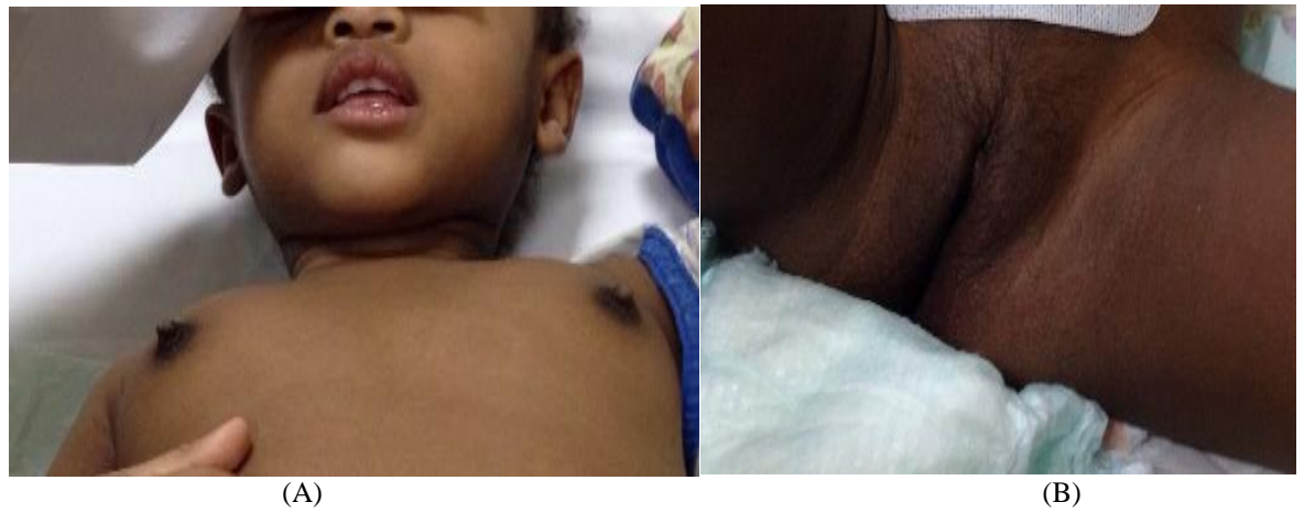
Fig 1: Photographs of the patient showing signs of isosexual precocious puberty; (A)Breast and (B) pubic hair