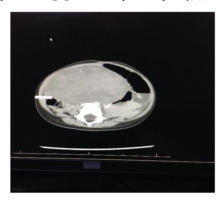
Fig 2: Abdominal computed Tomography (CT) scan, showing a heterogeneous large solid mass with cystic changes.

A diagnosis of isosexual precocious puberty was made. Laparotomy and right ovary was resected. It was encapsulated without any capsule breach. The left ovary was normal. Uterus was normal in size and endometrial cavity was expanded and filled with fluidly