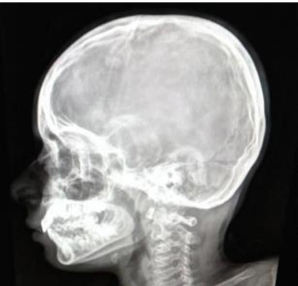
Fig-3: X-ray orbit showed hyperostosis of sphenoid wing right side.