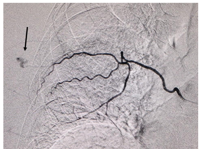
Fig-2: Urgent intercostal angiogram. Intercostal angiography revealed extravasation (arrow)