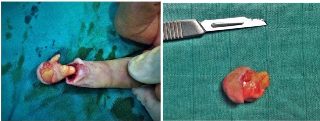
Fig-3, 4: intraoperative macroscopic aspect of the tumor

The histological study of the resection part, which measured 4 cm by 2 cm, concluded a lipoma with spindle cells without signs of malignancy (Fig 5,