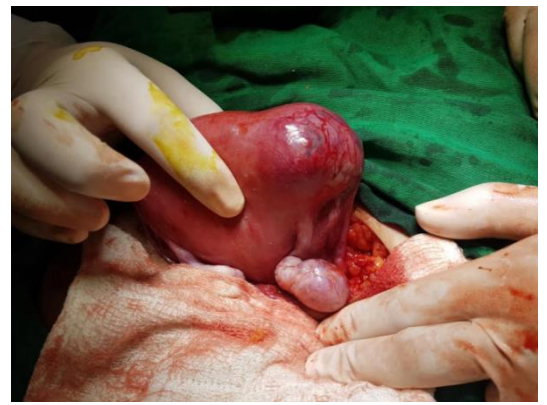
Fig-1: Picture denoting the intraoperative finding of an unruptured interstitial pregnancy

After all routine preoperative investigations which were found to be within normal limits, decision was taken to post patient for an exploratory laparotomy for corneal excision. Intraoperatively, there was presence of a 5cms X 4cms vascular mass at the right cornua with the round ligament arising medial to it.