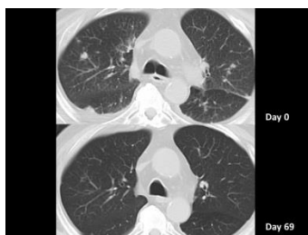
Fig-1: Whole-body computed tomography (CT) findings for the present case. CT to detect the septic focus revealed multiple small nodular lesions in the bilateral lung fields (upper: pre-treatment, lower: post-treatment)

the 17 th day, Nocardia infection and its drug sensitivity was determined based on the results of a culture analysis, so de-escalation of the antibiotics from meropenem to amoxicillin/clavulanate was performed. After confirming that the infection had subsided with no recurrence (Figure 1), he was transferred to a rehabilitation facility on the 76 th hospital day.