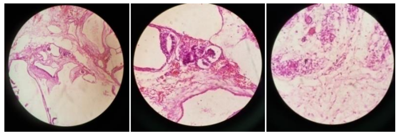
Fig-4: Microscopy of Kidneys- Multiple cysts lined by attenuated cuboidal epithelium. Interstitium showed primitive tubules and glomeruli along with undifferentiated mesenchyme