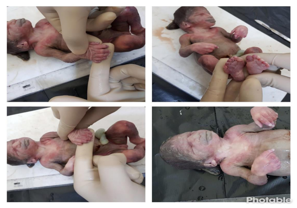
Fig-2: Bilateral Polydactyly of hands and feet with abnormal facial features