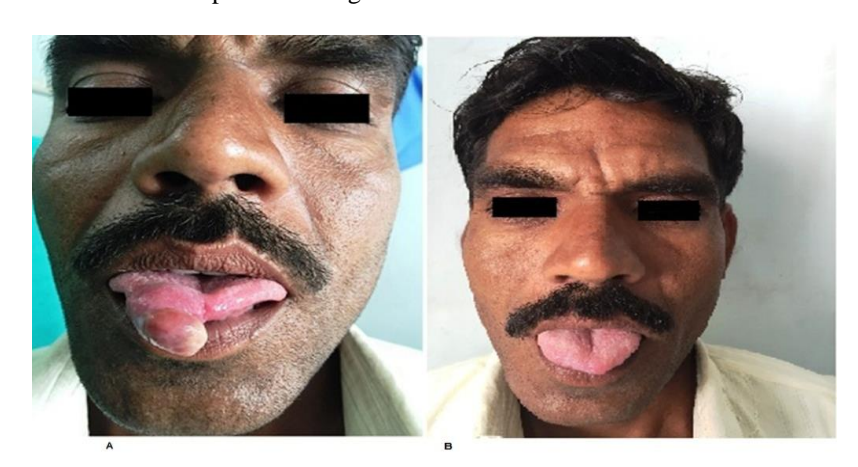
Fig.1-A: showing mass over right side of the tip of the tongue. B: postop after 12 months

over right side (Fig.1A). As told by the patient, there was no history of trauma and the mass was painless. The overlying mucosa was normal. There were no palpable cervical lymph nodes. The differential diagnosis included a fibroma and granular cell myoblastoma. The lesion was completely excised taking 5 mm margins under general anaesthesia (Fig.1B) and tissue was evaluated histopathologically. The gross features of the tissue were a round, firm, purplish brown mass, and 3.5cm in diameter. Microscopically tissue comprised of both hypocellular areas alternating with hypercellular areas & thin walled branching vessels with gaping sinusoidal spaces (staghorn configuration). Tumour cells are spindled to round with small amount of eosinophilic cytoplasm, bland vesicular nuclei without atypia (Fig.2). Immunohistochemistry showed a positive reaction towards the following markers: bCL2, CD34, and negative towards desmin and CK (Fig.3), yielding the diagnosis of hemangio pericytoma. The margins were negative, therefore no adjuvant treatment given. The patient was followed for 12 months, and no recurrence was seen.