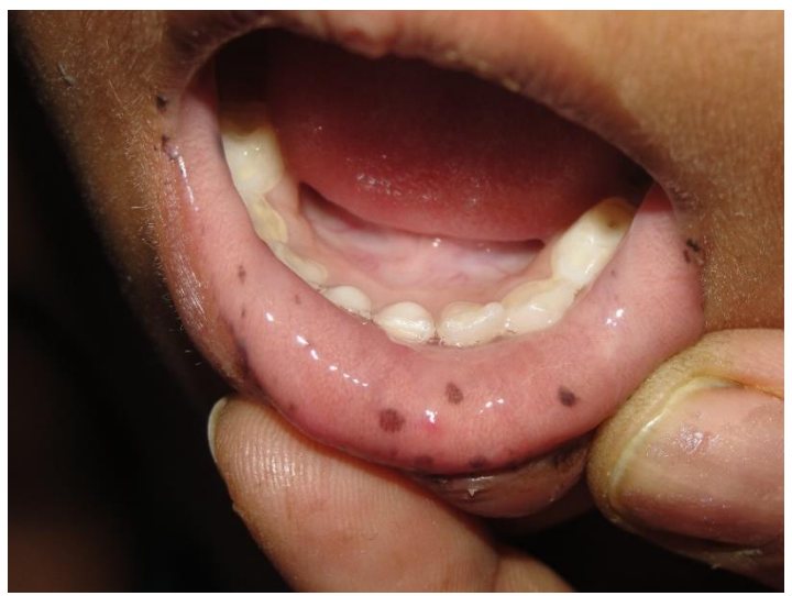
Fig 1: Pigmented macules on oral mucosa