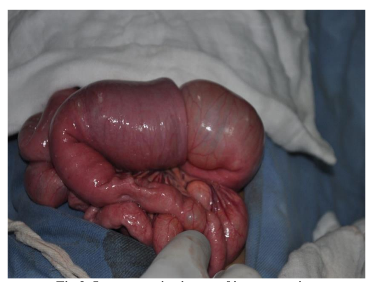
Fig 3: Intraoperative image of intussuception