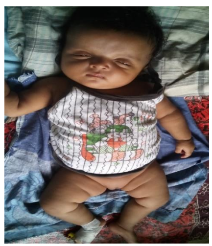
Fig.1 facial dysmorphism

shows frequent spike and slow wave arising on right hemispheric lead suggestive of epileptic encephalopathy. CECT brain shows agenesis of corpus callosum (fig.5, 6).