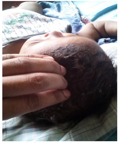
Fig.4 wide open fontanelle