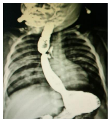
Fig-1: Fluoroscopy delineating the fistula

Patient was shifted on ventilator. She developed hyper-reactive airway disease and tracheostomy was done on post operative day 7. Patient expired on day 14 of surgery. Till then there was no evidence of a leak.