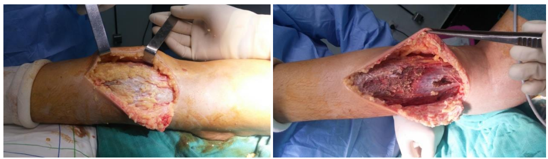
Fig-3: Peroperative image of the cyst

removal of drain on day two. Histological examination of the specimen revealed daughter cysts and fragments of lamellar membrane of the HC. Albendazole therapy, 200mg twice daily, was given for 12 weeks after operation. Clinical, radiological and serologic tests showed no recurrence 4 weeks after operation.