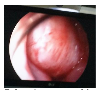
Fig-1: Endoscopic appearance of the tumor

Histopathological examination revealed hypercellular area showing spindle shaped cells with Verocay body, hypocellular area with loose stroma and few stromal cells and scattered atypical cells with hyperchromatic nuclei and occasional multilobated nuclei (Fig.3).