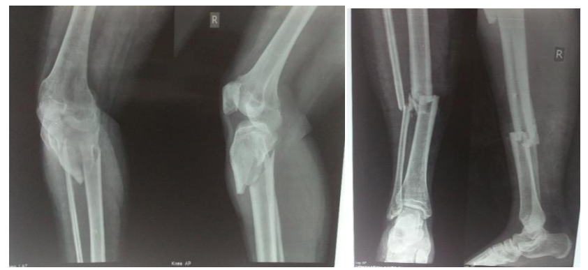
Fig 1: X-ray shows: proximal1/3rd tibial involvement with extension of proximal fragment

compression plating and reamed locked tibial intramedullary nailing was done through patellar tendon splitting technique.