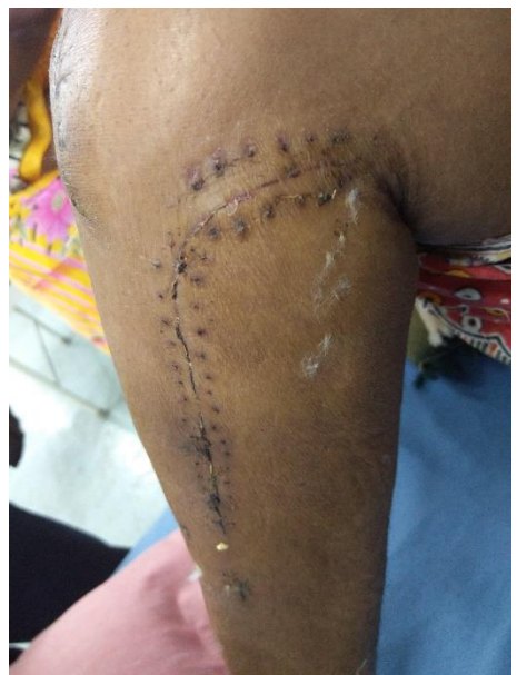
Fig: 4 showing post op wound after 14 days of surgery