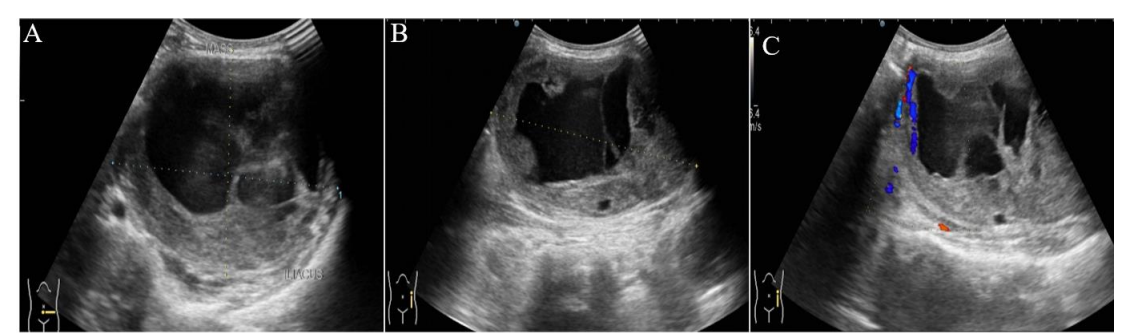
Fig-2 (A, B): USG showing a well-defined mass in retroperitoneum anterior to left iliacus, solid in the periphery with central cystic degeneration showing mild peripheral vascularity on doppler(C).