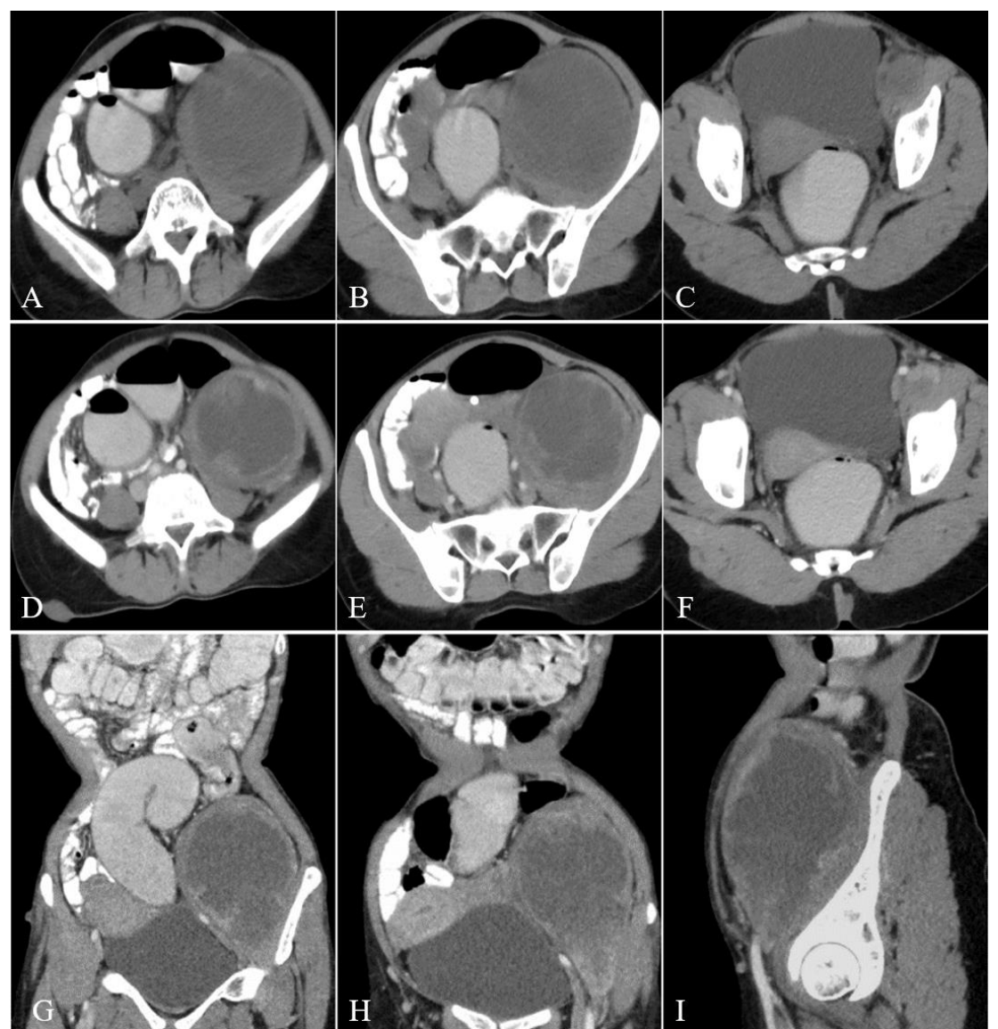
Fig-3: CT abdomen and pelvic plain (A-C) and contrast study (D-I) showing a well-defined mass in retroperitoneum anterior to left psoas and iliacus, extending inferiorly in left inguinal region with peripheral solid portion showing heterogeneous enhancement and central cystic degeneration with cutaneous neurofibroma in right gluteal region.