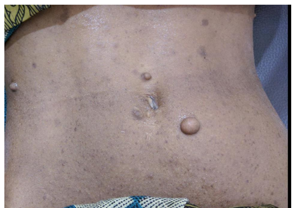
Fig-1: Photograph of abdomen showing multiple café au lait spots and cutaneous neurofibromas.

FNAC was suggestive of spindle cell tumour with multiple spindle cells with wavy nucleus without pleomorphism, with increased cellularity and arranged in fascicles intermingled with collagen (Figure 5).