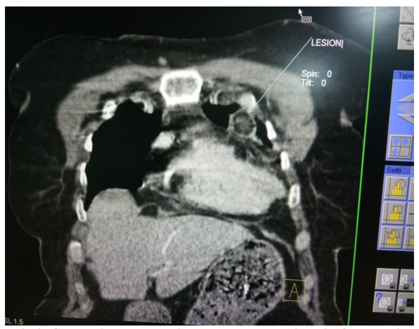
Fig-2: Coronal images revealing encapsulated pericardial fat necrosis