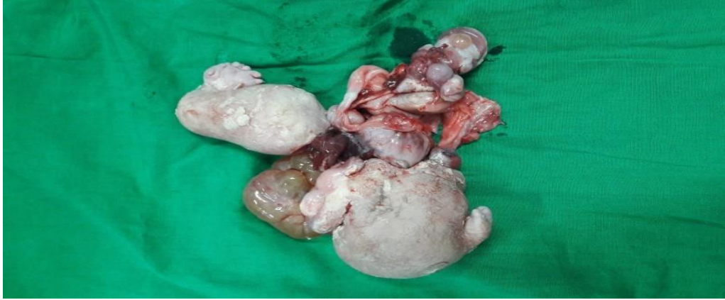
Fig-3: Specimen Photo