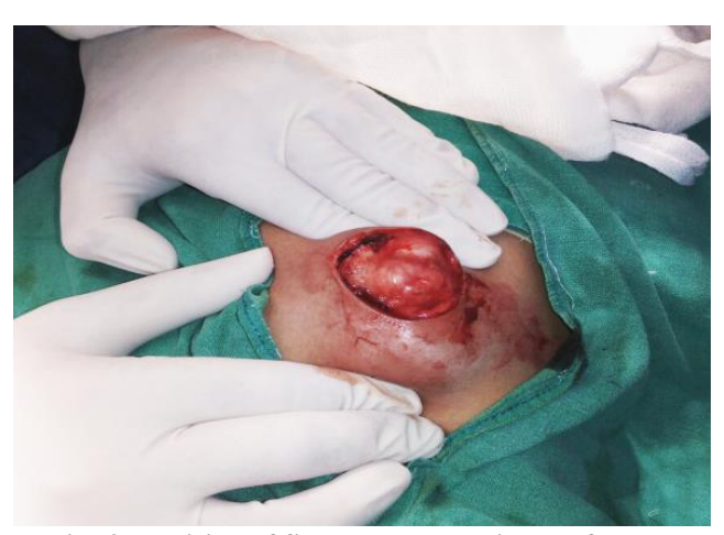
Fig-3: Excision of fibroadenoma being performed