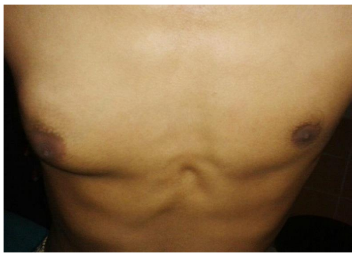
Fig-1: Erect profile of the patient showing enlargement of right breast.

examination. Report turned out as fibroadenoma of male breast with florid ductal hyperplasia.