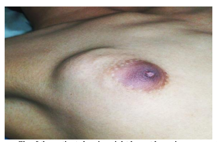
Fig-2: Supine profile of the patient showing right breast lump in upper outer quadrant.