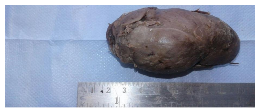
Fig-1: Gross image of Chorangioma