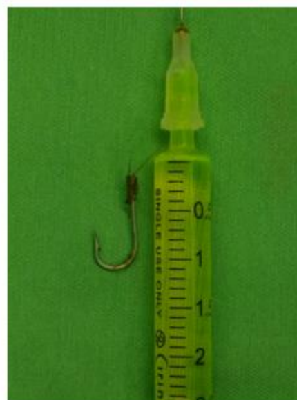
Fig-4: Fish-hook removed under “Needle Cover” method