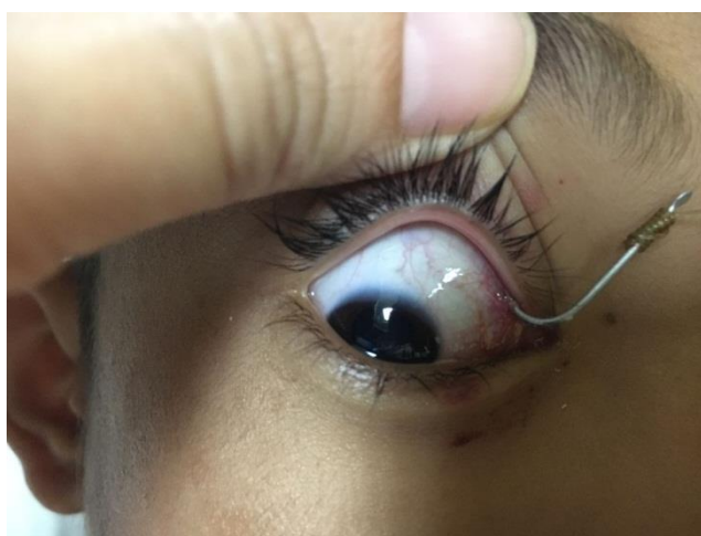
Fig-3: Fish-hook embedded in the palpebral conjunctiva just lateral to right upper punctum

Intraoperatively it was noted that the fish-hook pierced the conjunctiva 2mm lateral to the upper punctum; with no canaliculi injury. The small conjunctival laceration post removal was not sutured. Other ocular examinations were unremarkable. Post operatively intravenous amoxicillin-clavulanic acid was continued and topical moxifloxacin 0.5% four hourly was added. On the next day, his right vision reduced to 6/18, with pin hole aided 6/9. There was an anterior chamber reaction (cells 1+). Topical prednisolone 1% four times per day was added. On day 3, the right vision improved to 6/9 with occasional anterior chamber cells. The patient was allowed home with oral amoxicillin-clavulanic acid. Topical medications were continued. The patient was reviewed in a week. The conjunctiva healed well and the anterior chamber inflammation resolved.