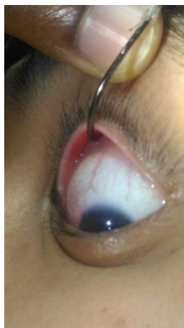
Figure 1: Fish-hook pierced the palpebral conjunctiva and embedded into the left upper tarsus