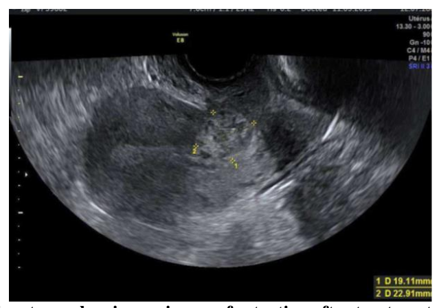
Fig-5: Sagittal section of the uterus showing an image of retention after treatment with methotrexate of extra uterine pregnancy on scar during the ultrasound control