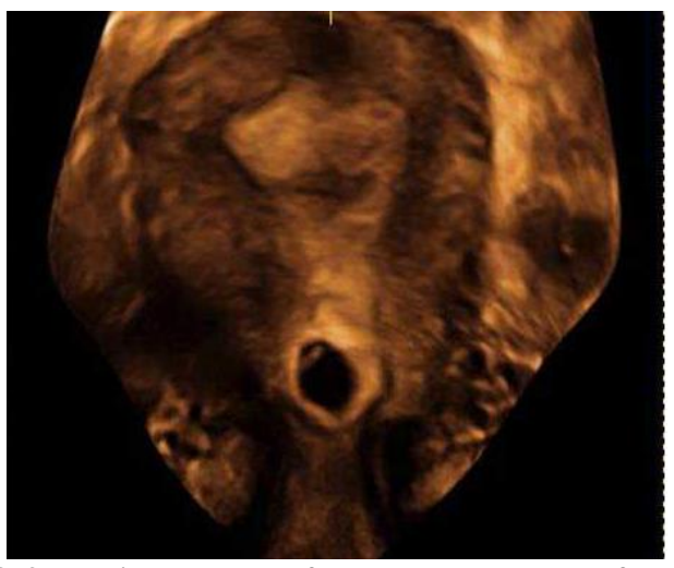
Fig-3: 3D pelvic ultrasound of pregnancy at the level of the scar