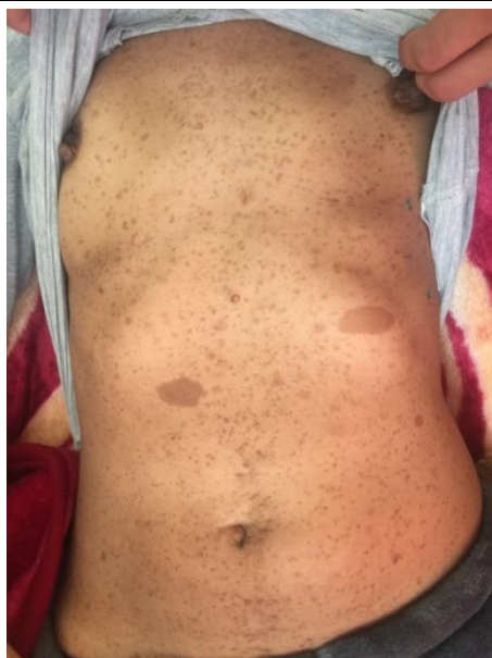
Fig-1: Dermatological lesion typical of Von Recklinghausen's disease “tâches café au lait”