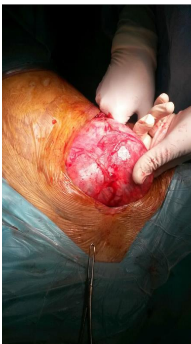
Fig-4: per-operative image of the extraction of the retroperitoneal mass

MPNSTs develop DE NOVO or from preexisting neurofibromas [7, 8]. The latter are the most common benign tumors in NF1 carriers, leading to the search for an MPNST on each neurofibroma that becomes symptomatic [9].