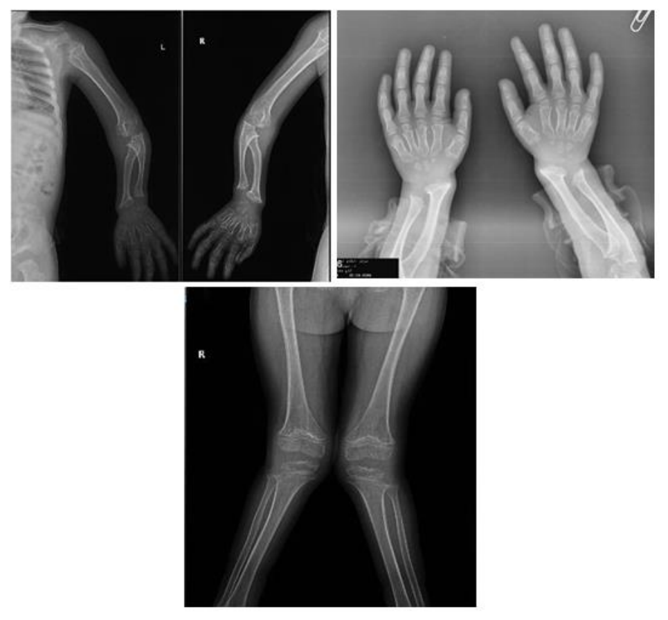
Fig-4: Bones have decreased density with Radius and Ulna is angulated promimally. Metaphyseal ends are irregular Metacarpals are pointed proximally

Bones have decreased density with Radius and Ulna is angulated promimally. Metaphyseal ends are irregular. Metacarpals are pointed proximally (figure4)