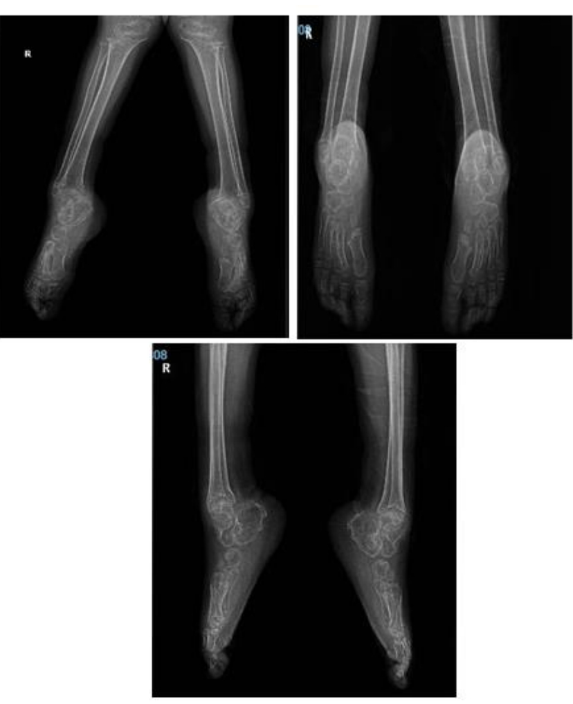
Fig-5: Epiphysis is irregular, Tibia and fibula are positioned outward Decreased density of bones with irregular borders of calcaneum. Metatarsals are pointed proximally