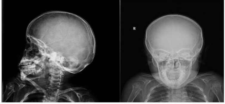
Fig-1: Sella is enlarged with prominent convolutional markings