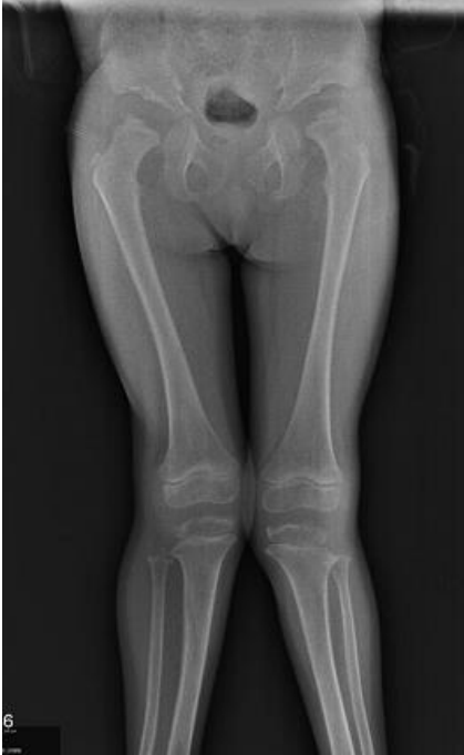
Fig-3: Simian pelvis with maldeveloped femoral capital epiphysis, shallow acetabulum Simian pelvis with maldeveloped femoral capital epiphysis, shallow acetabulum (figure3)

Hypoplasia of T11 and L2 vertebrae noted with platyspondyly of lower thoracic and lumber vertebrae having anterior beaking. (figure2).