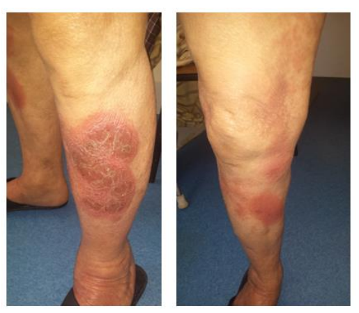
Fig-1,2: Diffuse several erythematous plaques very infiltrated sitting on the anterior surface of both legs

well limited with irregular border, dermoscopy showed a central ulceration, telangiectasia. The rest of the somatic examination is without particularity. The patient underwent 2 skin biopsies, the first one at the level of the plaques returned in favor of a fungoid mycosis [Fig 1], and the 2nd at the level of the tumor returned in favor of an infiltrating nodular basal cell carcinoma [Fig 4]. The patient was initially treated with very strong class of dermocorticoids for the plates, then PUVA therapy after basal cell carcinoma exeresis.