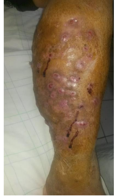
Fig-1: right leg volume increased, aspect of nodular prurigo-like with fistulas budding lesions in places

HIV serologies, and hepatitis C and B were negative. There was no diabetes. A biological assessment showed hypochromic microcytic anemia (hemoglobin level at 9 g/dl) and iron deficiency. The search for primary immunodeficiency was negative. Bacteriological analysis of cutaneous biopsies showed Staphylococcus aureus and the search for Actinomyces germs was negative. Ziehl-Neelsen stain, research bacillus Koch, and fungal culture were negative too. Histopathological examination of a cutaneous biopsy showed a hyperplastic spongiotic epidermis, a dermis formed by a loose granulation tissue rich in congestive