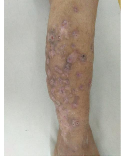
Fig-3: Drying of lesions and decrease in leg volume after 4 months of treatment