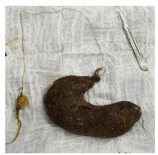
Fig-5: Completely extracted stomach-shaped trichobezoar with its tail extending to the small bowel