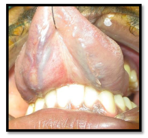
Fig-1: pre-operative photograph showing a mass on ventral surface of tongue

compared to adjacent soft tissue on ventral surface of tongue more on right side of midline causing elevation of tongue. No sign of local inflammation or draining sinus or any abnormal sensation like paresthesia was found on examination and tongue movements also were normal and swelling were not causing airway obstruction. No other abnormality found anywhere intra orally as well as extra orally (fig1).