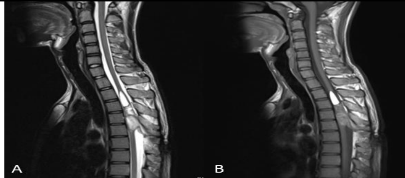
Fig-1: (A, B) Sagittal T2WI & T1W showing well defined ablong intramedullary lesion in spinal cord extending from second to fifth thoracic vertebra fat component appears hyperintene on both T1W & T2W and soft tissue component heterogeneously hypertintense on T2WI and heterogeneously hypoinetnse on T1W