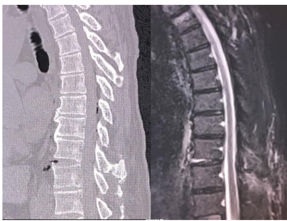
Fig-2: Computed tomography (CT) and magnetic resonance image (MRI) on arrival MRI demonstrates an area of high intensity in the anterior portion of the 10 and 11<sup>th</sup> thoracic spine with the posterior portion of the 11 and 12<sup>th</sup> thoracic spine. Left, sagittal CT view; Right, sagittal MRI view