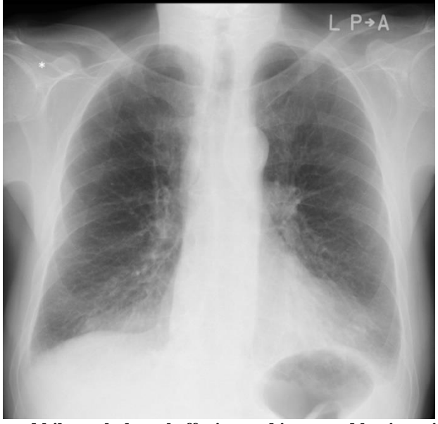
Fig-2: Chest radiography showed bilateral pleural effusion and increased haziness in the bilateral cardiophrenic angles