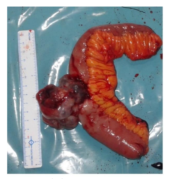
Fig-2: Resected growth