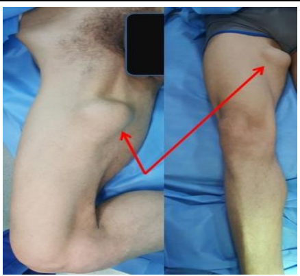
Fig-1: hydatid cyst of the adductor compartment: pre-operative aspects