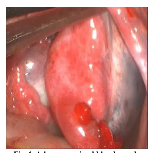
Fig-4: Adnexa regained blood supply