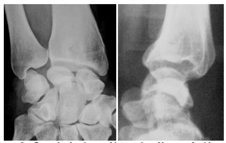
Fig-3, 4: X-ray after 7 months showing good integration of bone graft without recurrence