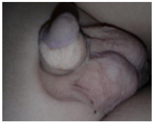
Fig-2: EGO image illustrating pubertal delay in an 18-year-old patient