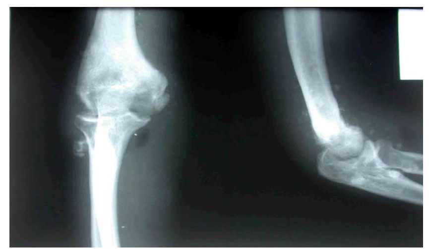
Fig-3 (a-b): Postoperative X-rays of Face and profil of the elbow showing the exeresis of the ossified mass

Available Online: https://saspublishers.com/journal/sjmcr/home