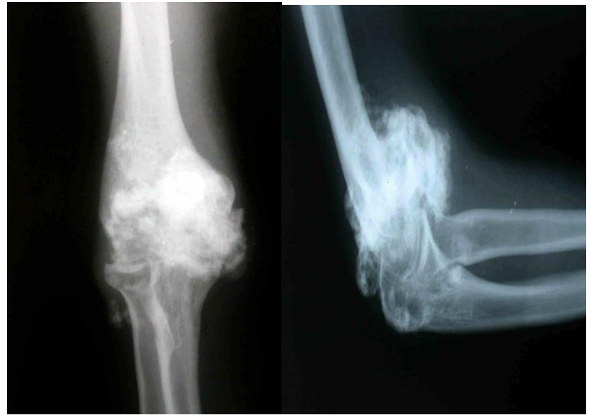
Fig-1 (a-b): X-ray of Face and profil of the elbow_shows a large ossified mass developed behind the humeral pallet and periarticular

A. Lagdid et al., Sch. J. Med. Case Rep., May 2018; 6(5): 365-367