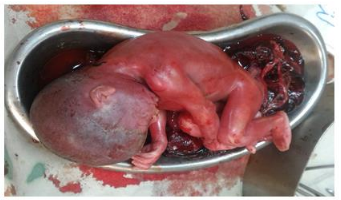
Fig-1(a): Dead fetus of about 22 weeks with placenta