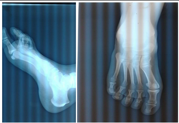
Fig1: Standard X-ray of the foot demonstrating talo-navicular osteoarthritis with flattening of the navicular bone in the form of a distorted comma