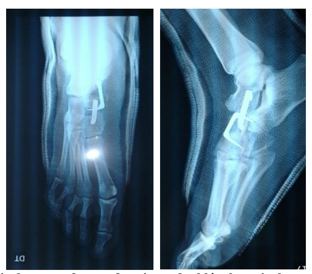
Fig-3: postoperative radiological aspect after performing a doublé talonavicular and naviculocuneal arthrodesis