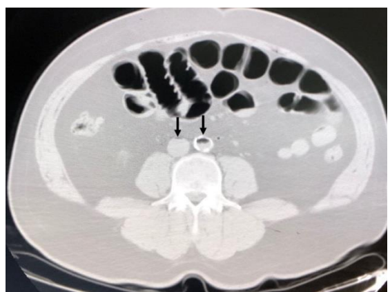
Fig-5: Truncal computed tomography (CT) 5. CT revealed multiple gas molecules at the ventral side of the intestine and in the inferior vena cava and descending aorta (arrow)

Fig-4: Truncal computed tomography (CT) 4. CT revealed multiple gas molecules in the portal vein at the liver and the expansion of gases at the ventral side of the intestine and pneumorrhachis (arrow)