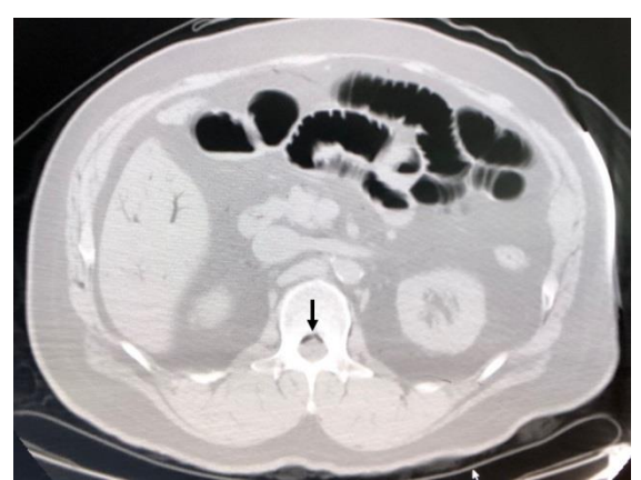
Fig-4: Truncal computed tomography (CT) 4. CT revealed multiple gas molecules in the portal vein at the liver and the expansion of gases at the ventral side of the intestine and pneumorrhachis (arrow)