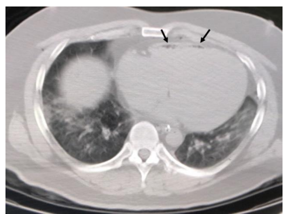
Fig-2: Truncal computed tomography (CT) 2. CT revealed multiple gas molecules in the right ventricle (arrow)