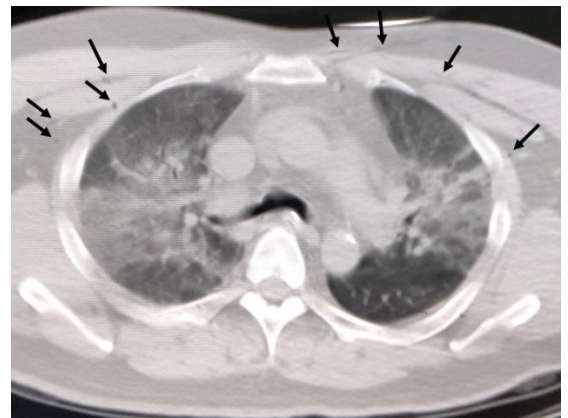
Fig-1: Truncal computed tomography (CT) 1. CT revealed multiple instances of intravascular gas at the ventral side of the chest wall (arrow)

ventricle, the portal vein in the liver, the inferior vena cava, the descending aorta and the spinal canal (Figure 1-5). However, head CT showed no gas in the brain.